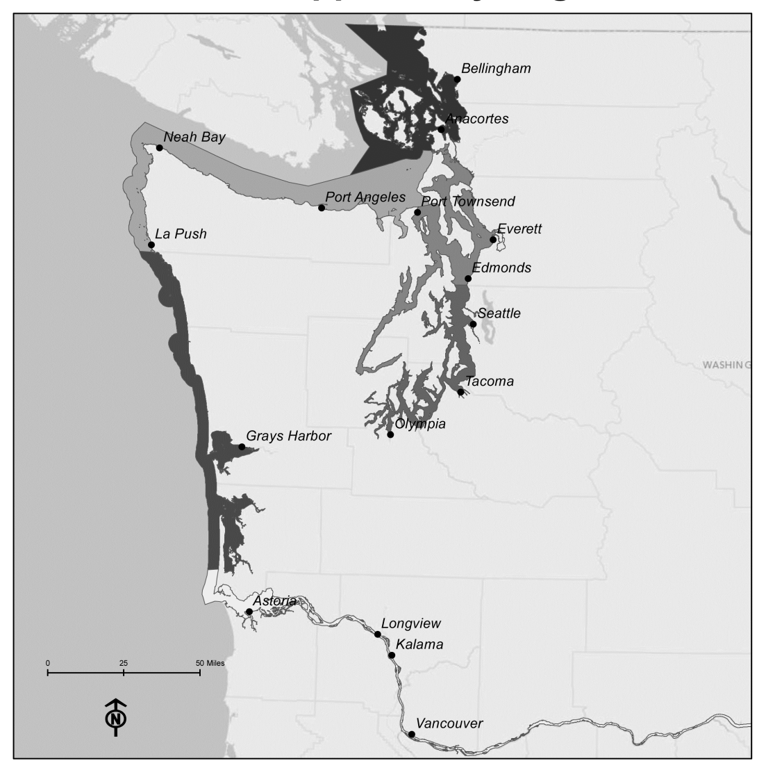
NOTE: In the event of a spill VOOs from any region may be called to the site to assist with the response.